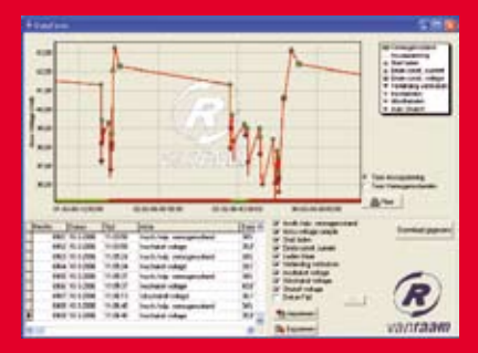
Graphical representation of battery voltage and support level

PC screen dump for setting up the controller, support level from 0 to 100% selectable